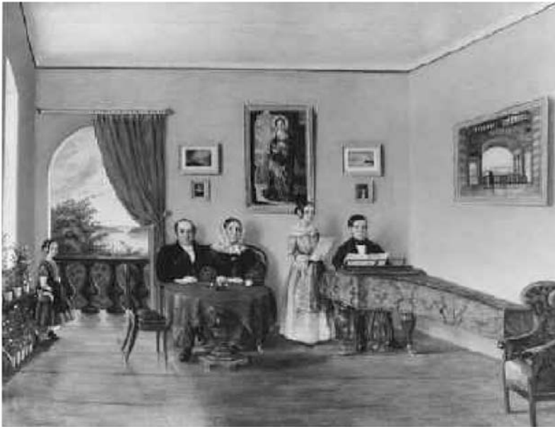
Historisches Museum der Stadt Wien